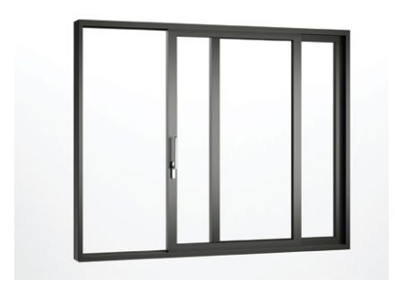
SL400 Aluminum sliding door